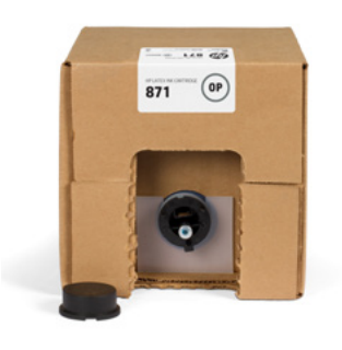
HP Latex Optimizer Achieve high image quality at high speed:

• Interacts with HP Latex Inks to rapidly immobilize pigments on the surface of the print