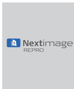
Nextimage REPRO software