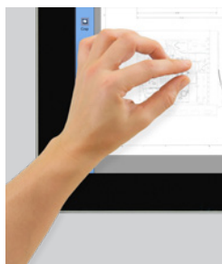
Touchscreen Full HD 21.5" touchscreen